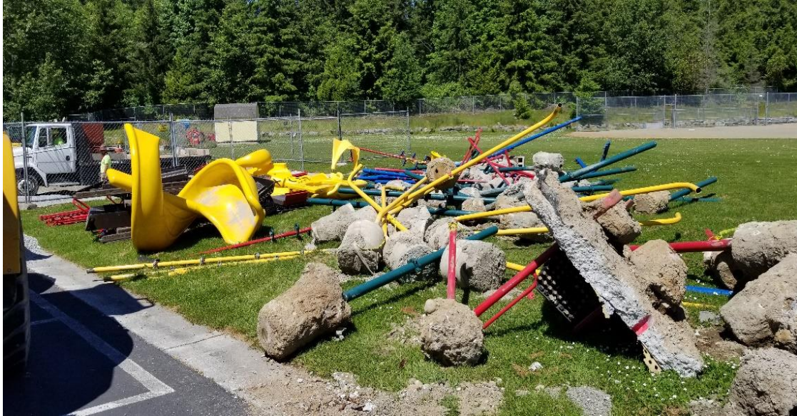
EXISTING PLAY STRUCTURE DEMOLITION