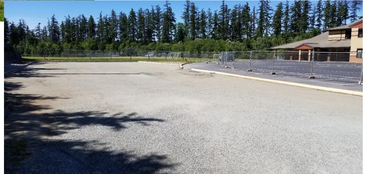
DEMOLITION OF EXISTING PLAYTOYS