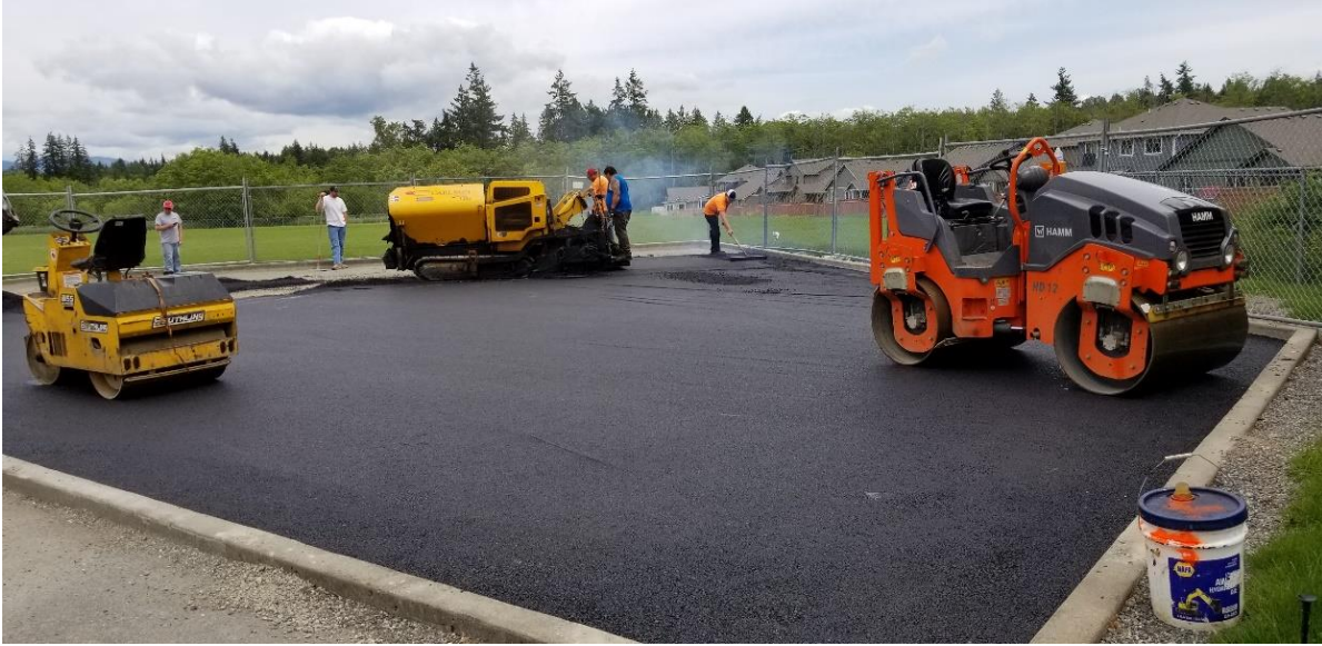
ASPHALT BEING INSTALLED