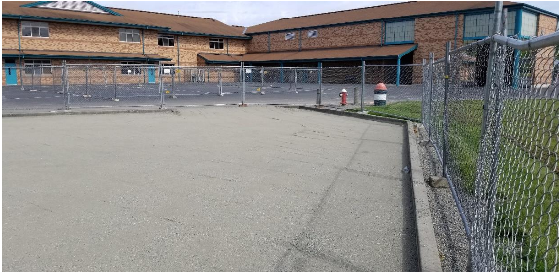
PLAY AREAS SUBGRADE READY FOR ASPHALT